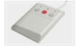
Control panel for remote management