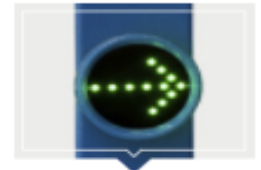
LED indicator of way direction

Turnstiles can also be completed with full height gate with electromechanical lock and railing systems, produced in the same design.