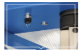
Turnstile mechanical unlocking